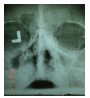
Figure1: Paranasal sinuses x-ray, septal deviation, opacity of the maxillary sinuses, right ethmoid and frontal sinusitis, also opacity of the right nasal cavity with thickening of mucosa was evident.